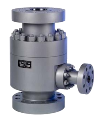
ARC Valve (Automatic Re-Circulation Valve)