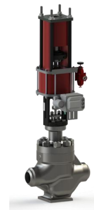
New zero leak, severe service control valve

Note: AOI Margin excludes special and restructuring charges.